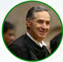
Luís Roberto Barroso

Chief Justice of the Brazilian Supreme Court